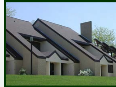
Orchard Dorm Suites

Dorm suites accommodate up to 48 people in 12 suites.