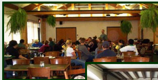
McCrary Dining Hall

Morning and afternoon snack service is included with the daily meeting rate. Snacks are served in the meeting room and include a light refreshment with beverages.