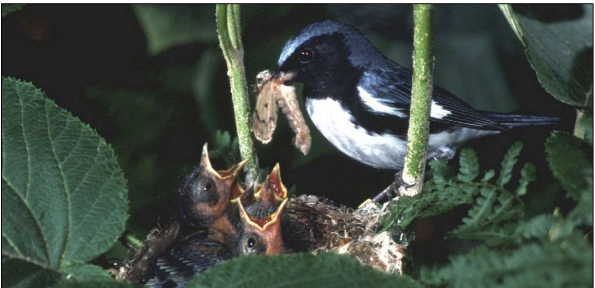
Male Black-throated Blue Warbler feeding nestlings. Nests of this species are built typically less than one meter above ground in a shrub such as hobblebush.

Richard's team monitors populations of over 30 different bird species. This involves waking up every morning before the sun comes up and traveling to the far reaches of the forest. They listen for, look for, identify, and count all the different birds seen in each area. These ecologists recorded the numbers of birds observed per 10 hectares,