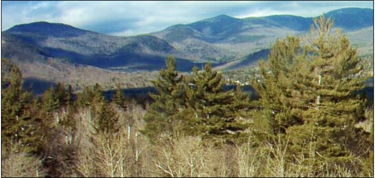
View of the Hubbard Brook Experimental Forest