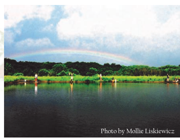
Students catching beetles under rainbow at the Experimental Pond Lab.