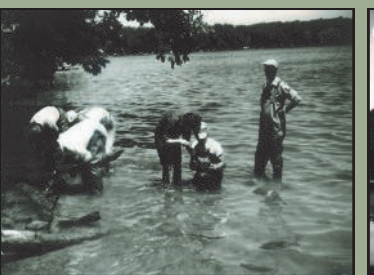
W.K. Kellogg's estate on Gull Construction of the Stack Lake deeded to MSU and the W.K. Kellogg Biological Station is established, 1952