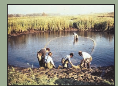
National Science Foundation (NSF) funds construction of Experimental Pond Laboratory, 1971