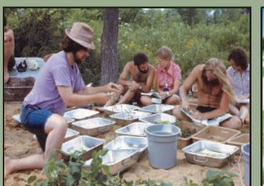
KBS designated a national Experimental Ecological Reserve, 1978