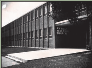
Building with classrooms and laboratories funded by the W.K. Kellogg Foundation, 1959