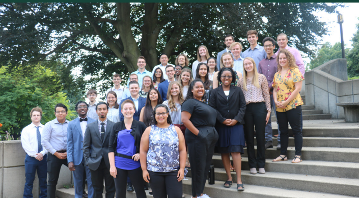
THE 2019 KBS UNDERGRADUATE COHORT

This summer, KBS served 72 undergraduate and graduate students taking courses at KBS, and mentored 33 undergraduates in internship, URA and REU programs. Their experiences culminated in the annual undergraduate symposium, which showcased the students' research and internship projects.