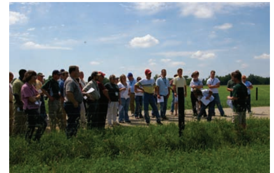
The KBS Pasture Dairy Center offers guided tour for farmers, students, educators, researchers, and community groups.

Research at the dairy will focus on how automatic milking and pasture-based systems impact the environment, dairy cattle, farmers and consumers. Research will include the impacts of management on pasture growth, nutrient and energy use, and the welfare and productivity of dairy cattle. Social scientists will study how farmers and consumers view this technology and how incentive structures and markets influence adoption of these practices.