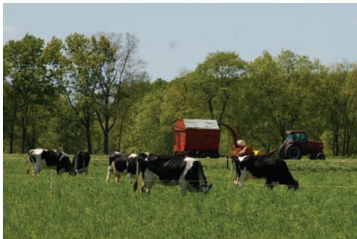
Pastures are harvested by cattle during the grazing season and as conserved forage for winter feed.

Many small and mid-sized dairies in Michigan rely on pasture as an important part of their management system. Pasture is a lower cost alternative to feeding stored feeds. Cow longevity is often greater in pasture-based dairies than in confinement dairies. Lower feed costs and greater cow longevity help make pasture-based dairies a profitable option for