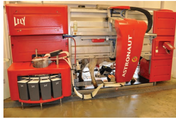
KBS dairy Lely robotic milker.

AMS ('robotic milking') was developed in Europe to address labor issues on dairy farms and became available there in 1992. This technology was introduced